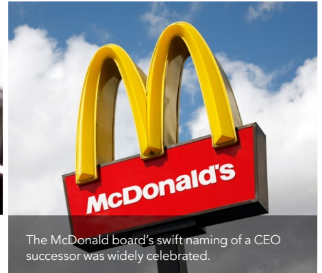
The McDonald board's swift naming of a CEO successor was widely celebrated.

So, in this element of the study, the research team hypothesised that