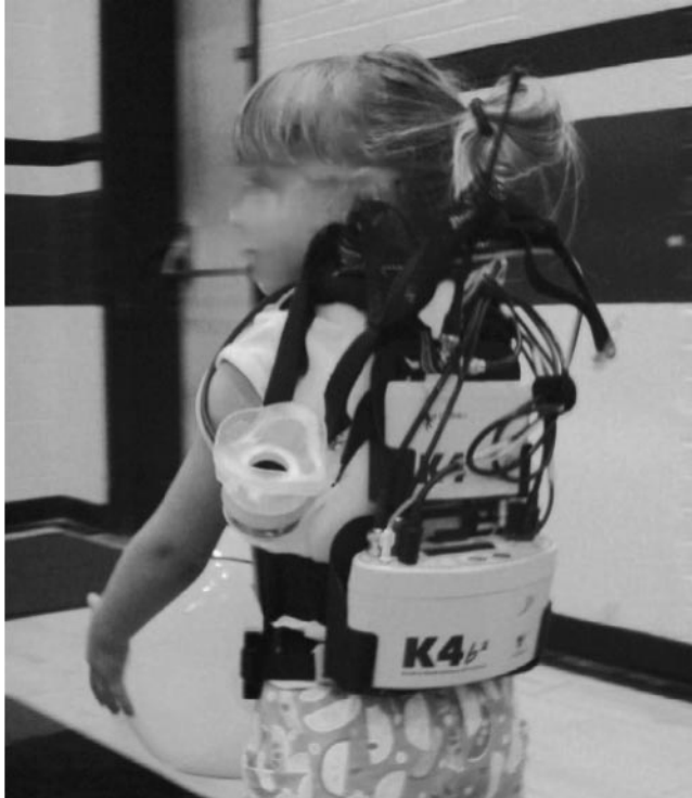
Figure 1: Four-year-old child wearing the Cosmed K4b2 system for measurement of \dot{V}O_2 during physical activity.