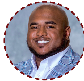
Quintavis Cureton Educational Leadership and Policies